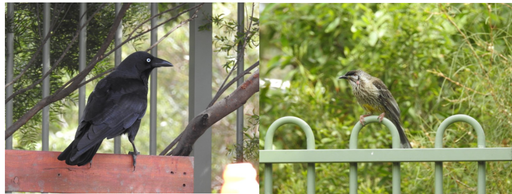
We watched the parents swoop the local ravens to keep them away from their hatchling babies.

We used the "Bird Book" to find out what birds they were.